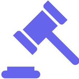
Due Process Complaint/Hearing